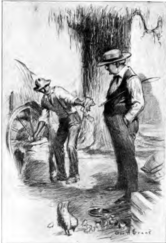
Offered to pay me next morning, an' seemed like he had about a bushel of Confedrit money.